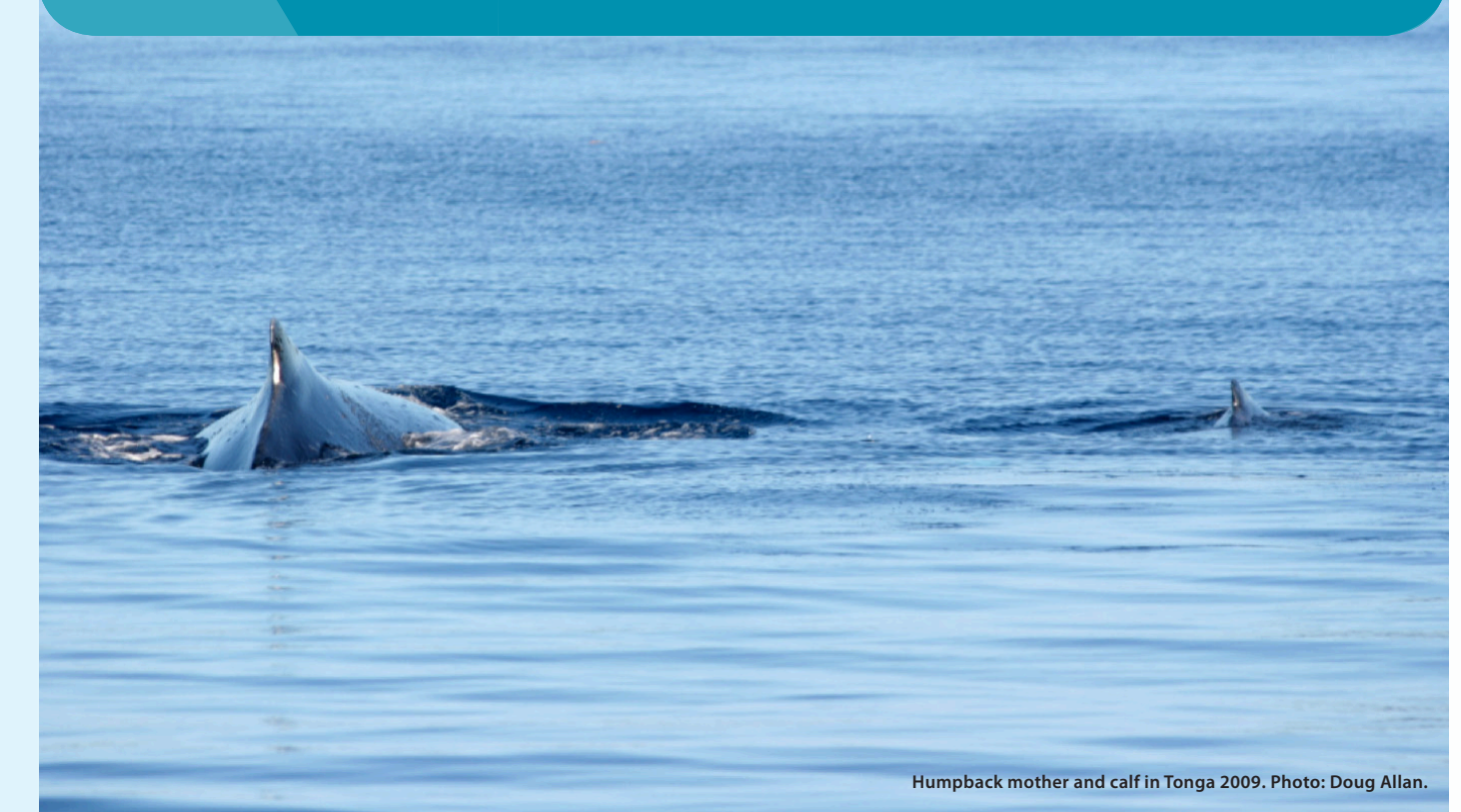
Humpback mother and calf in Tonga 2009.

The humpback whales ( Megaptera novaeangliae ) of Oceania, and their story from whaling to whale watching, illustrates the changes in society's values and a shared responsibility for their recovery. Importantly, lessons from Oceania's humpback whales illustrate the commitment and investments needed to ensure trends of biodiversity loss are reversed in line with CBD goals; and the appropriate time scales for this to take place for such long-lived species.